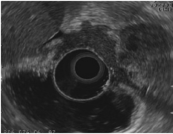
Fig. 1. Typical image of advanced gastric cancer obtained by ER-ES.

Scores of six independent evaluators were : 5, 5, 4, 5, 5, and 5 for absence of artifacts caused by multiple ring echoes ; 5, 5, 5, 5, 5, and 5 for visibility of tumor echo ; 5, 5, 5, 5, 5, and 5 for visibility of deepest part of tumor ; 5, 5, 5, 4, 4, and 5 for visibility of whole echo of tumor and its surrounding organs.