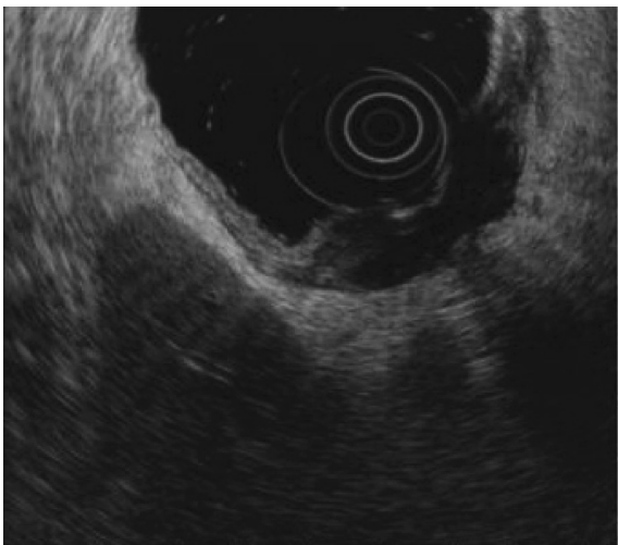
Fig. 2. Typical image of advanced gastric cancer obtained by MR-ES.

Scores of six independent evaluators were : 5, 5, 4, 5, 5, and 5 for absence of artifacts caused by multiple ring echoes ; 5, 5, 5, 5, 5, and 5 for visibility of tumor echo ; 5, 5, 5, 5, 5, and 5 for visibility of deepest part of tumor ; 5, 5, 5, 4, 4, and 5 for visibility of whole echo of tumor and its surrounding organs.