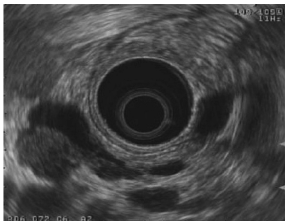
Fig. 5. Typical image of IPMN obtained by ER-ES.

Scores of six independent evaluators were : 4, 4, 5, 5, 4, and 5 for absence of artifacts caused by multiple ring echoes ; 4, 5, 5, 5, 5, and 5 for visibility of all lesions ; 4, 5, 5, 4, 4, and 5 for absence of artifacts in dilated branched pancreatic duct.