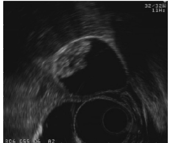
Fig. 3. Typical image of gallbladder lesion (gallstone) obtained by ER-ES.

We chose gastric cancer, gallbladder lesions, and branch-duct type IPMN for this study for the following reasons. EUS-FNA, for which the L-ES is required, is now widely used to diagnose digestive diseases and others ; however, diagnosis based on EUS morphology is more important than diagnosis